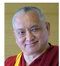
Lama Zopa Rinpoche